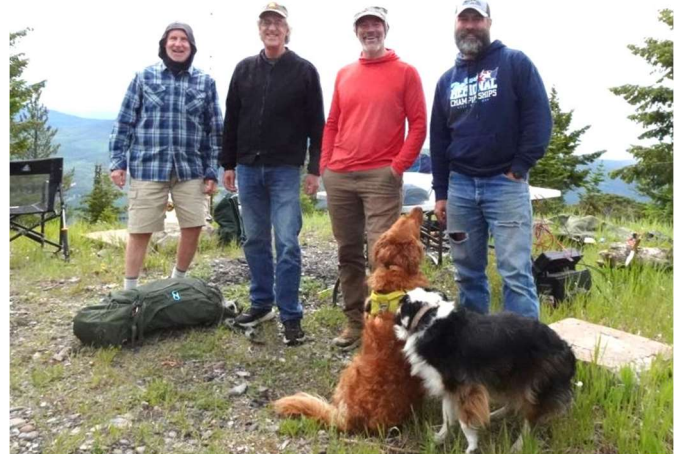
N3XFD, AE7AP, KK7SDH, KF7PXT